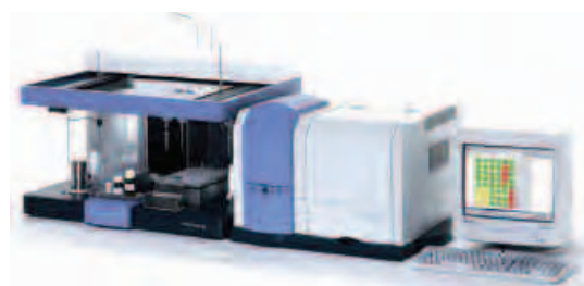
The D-Count® system

Following standard laboratory separation procedures (stomaching, centrifugation, etc), samples are directly loaded on to the sample preparation unit of the D-Count or BactiFlow ALS. Each system then automatically treats the samples with appropriate labelling reagents and injects these into the analyzer. Samples are treated with Fluorassure reagents which label only viable