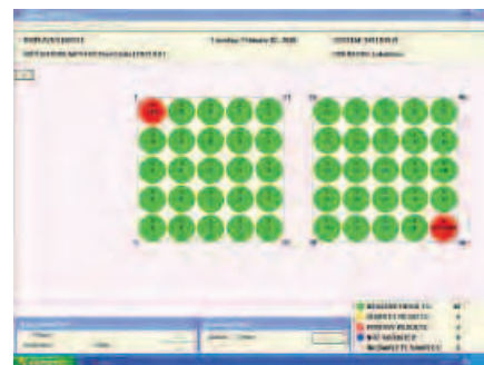
Digital results on PC monitor.

Through the combination of automation, speed and sensitivity, Chemunex's analysers