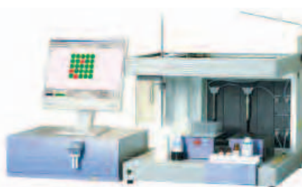
The BactiFlow® ALS

In the last few years, several alternative methods have been developed to provide earlier results in one or two days. But the majority of them have limitations such as sensitivity of detection, susceptibility of